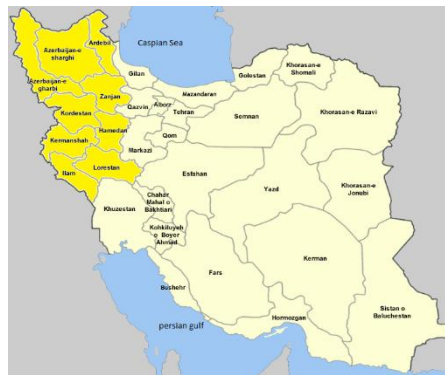
Figure 2. Desired regions to expand after-market business